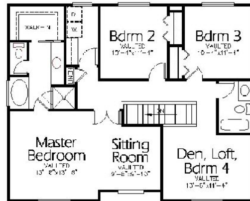
Upper Level 1151 Sq. Feet